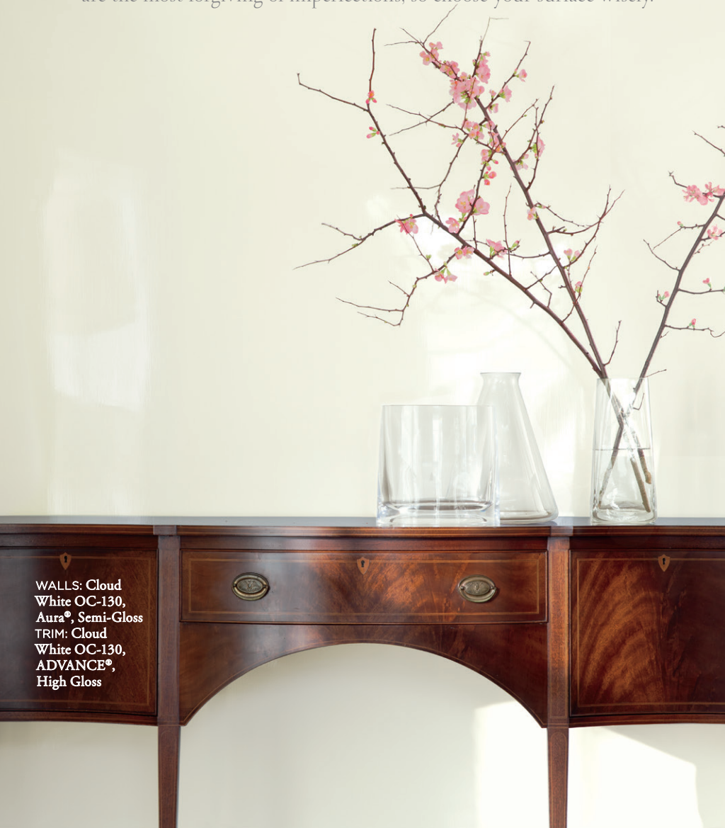
WALLS: Cloud White OC-130, Aura®, Semi-Gloss TRIM: Cloud White OC-130, ADVANCE®, High Gloss

SHEEN Don't shy away from sheen—trust us, it can work magic on a room. Painting the walls with a gloss will add dimension and levity. Or try a semi-gloss on a low ceiling—it will move light around the space and create the illusion of height. Just remember: Shiny finishes look best on smooth, clean surfaces while matte or flat paints are the most forgiving of imperfections, so choose your surface wisely.