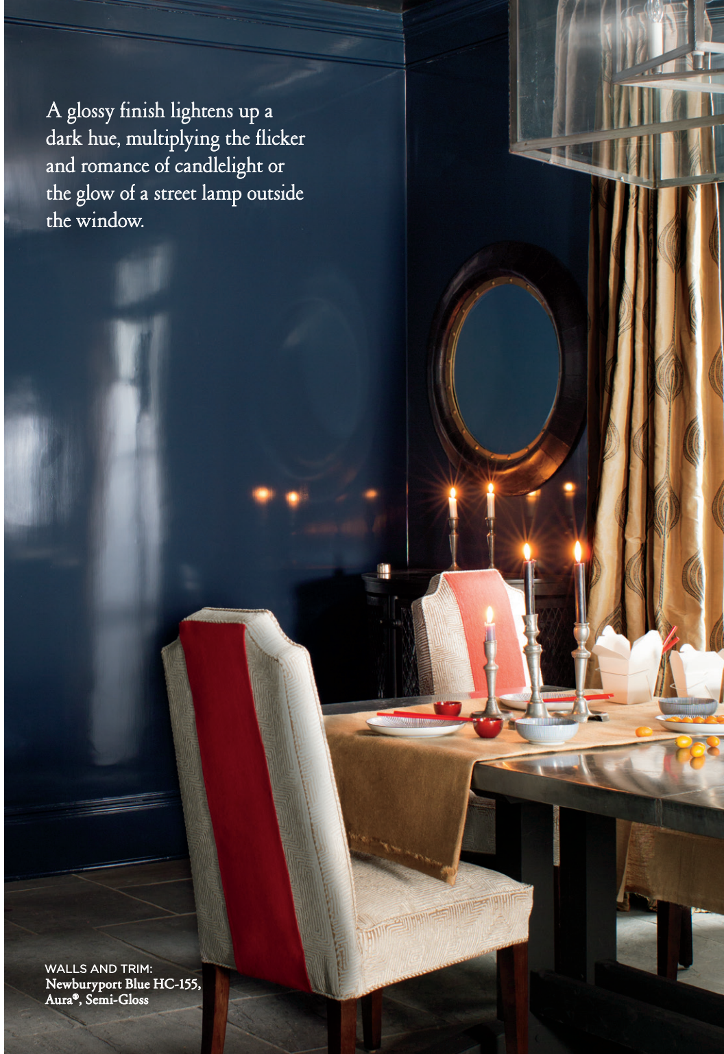
WALLS AND TRIM: Newburyport Blue HC-155, Aura®, Semi-Gloss

A glossy finish lightens up a dark hue, multiplying the flicker and romance of candlelight or the glow of a street lamp outside the window.